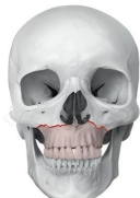
Le Fort I

Horizontal maxillary fracture, separating the teeth from the upper face.